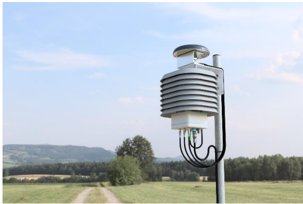
3S GmbH, http://www.3s-ing.de